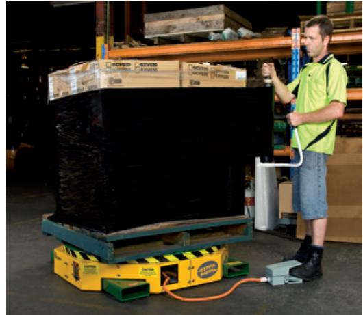
Ideal for both regular and irregular shaped pallet loads.

Specifications subject to change without notice. Printed in Australia.